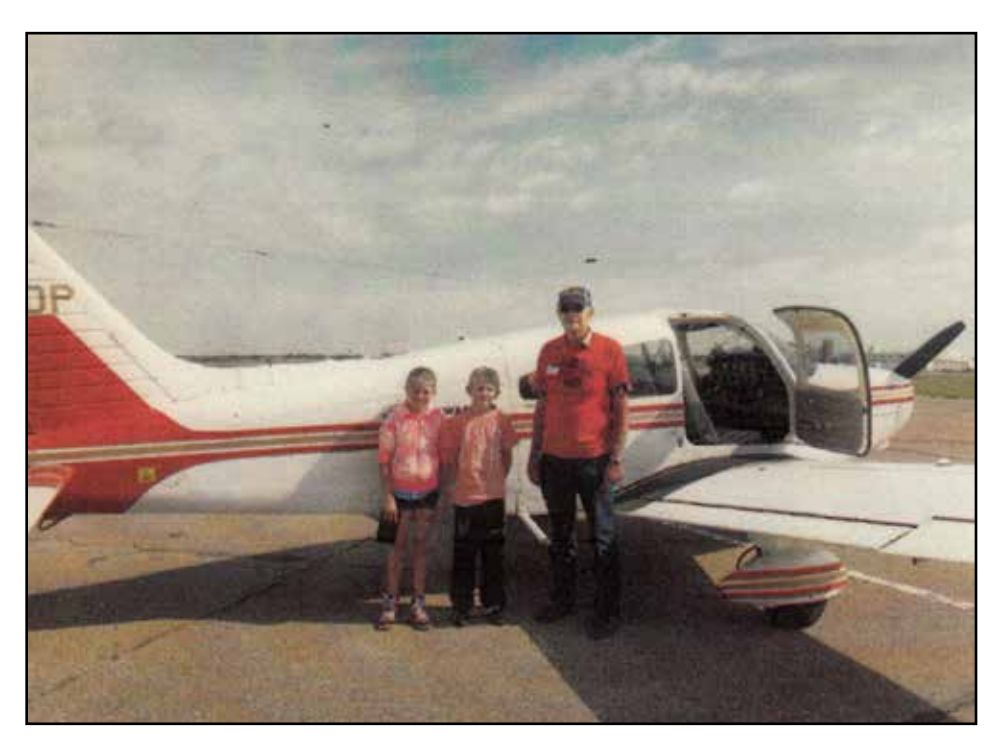
COPA For Kids Day – Aug 2013

One year, I think it was 2013, when we were still operating out of the City Center Airport, we seemed to have a great number of Black kids show up. Perhaps they were refugees from Syria, or someplace. After one of my flights, I unloaded my two young passengers, stood with them as they had their photos taken with the airplane and me, and went inside to find my next load. There was a little girl who was pestering her parents to let her go on a flight. Her elder siblings were lining up for flights, and she wanted to go for an airplane ride, too. Unfortunately for her, she was much