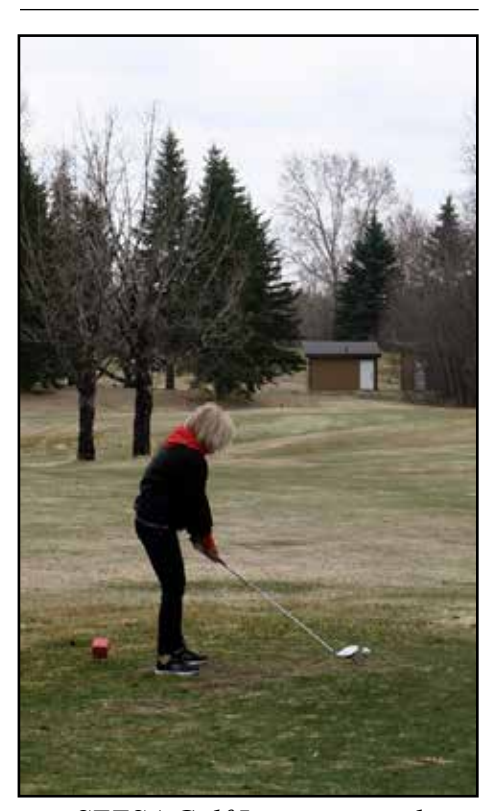
SEESA Golf League - good exercise and good fun!

Here is a decision making tool that comes from a different perspective – it might help you decide. <a href="https://www.edmonton55.com/risk-vs-benefit-helping-you-decide/">https://www.edmonton55.com/risk-vs-benefit-helping-you-decide/</a>