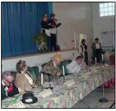
'The Duke's Descent', March 11, 2006 was the impetus for The Accidental Drama Club.

The family will host a celebration of her life when it is safe to gather again.